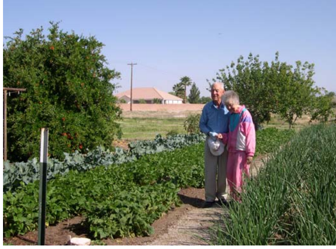
Fruit trees to the northwest will shade the garden in late afternoon