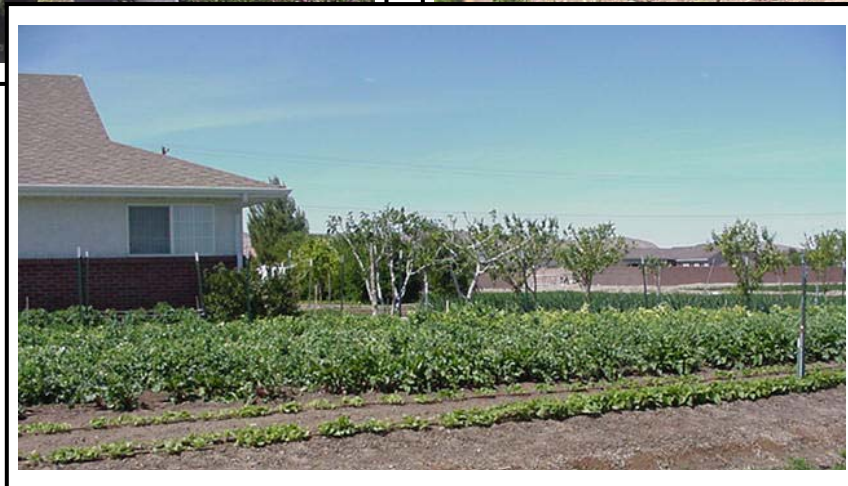
Sylvan and Maurine Wittwer in their Logandale garden