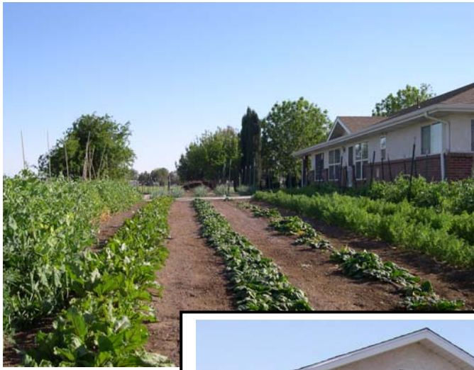
March 31 East side of house - tomatoes against house get afternoon shade.