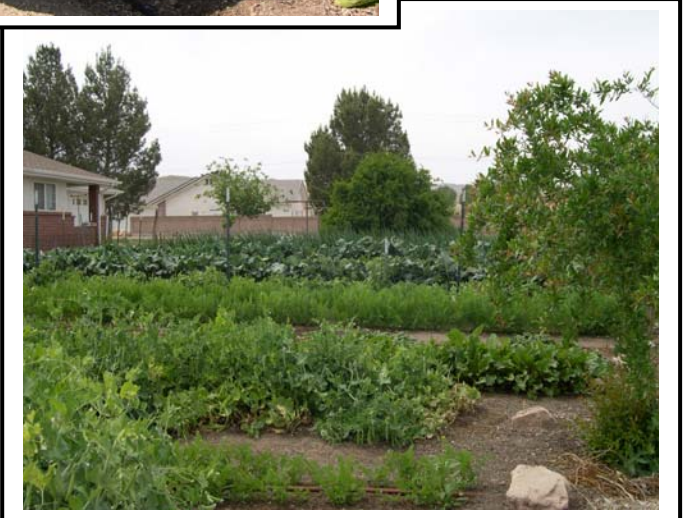
Vegetables and fruit trees as landscaping